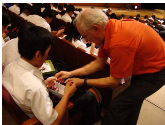
With high school students at workshop

July 13 th -18 th - Carbon 2008 conference in Nagano – invited lecture and high school workshop in Suzaka, near Nagano. Filming sessions for European Nonotechnology production.