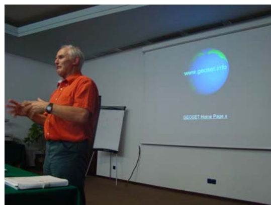
Talking about www.geoset.info in Croatia

August 25 th -29 th – Invited speaker at hydrogen conference on Brijuni island, Croatia .