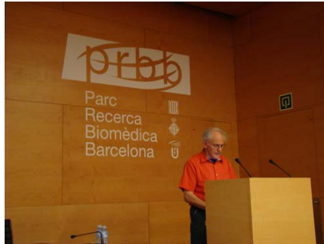
Talking in Barcelona

June 3 rd – 6 th – Talks at the Parc Recerca Biomedica Barcelona and public and university talks in Tarragona .