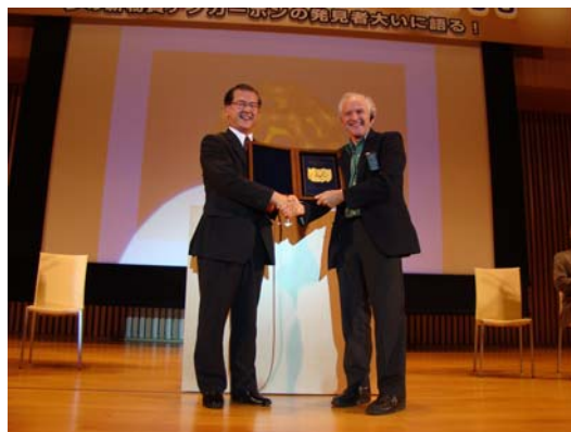
Presentation of Lectureship Award Nagoya