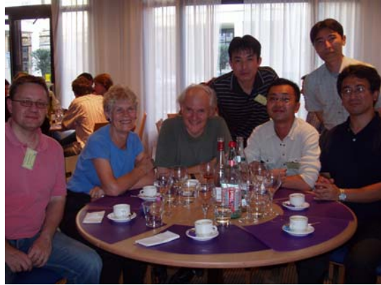
Dinner with summer school participants

July 10 th -20 th – Various events in Japan