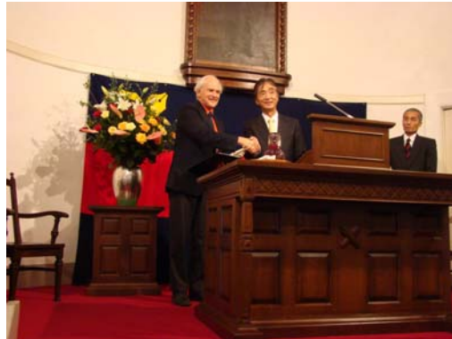
Presentation of Hon. DSc at Keio

July 11 th – Invited speaker celebrating 50 years of collaboration between the British Embassy, Tokyo and Keio University . Honorary degree from Keio University.