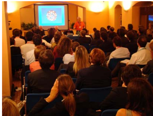
Talking to 'future leaders' in Italy