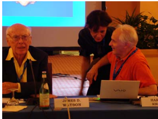
Sharing a session with Nobel Laureate Jim Watson

September 4 th – 6 th – Invited speaker at the Ambrosetti world forum (Intelligence on the World, Europe and Italy) on Lake Como. Attended by prominent scientists Mario Molina, James Watson and political figures – Shimon Peres, Mahmud Abbas and Dick Cheney.