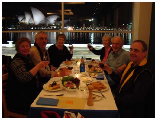
Dinner with Sydney hosts

August 25 th -29 th – Invited speaker at hydrogen conference on Brijuni island, Croatia .