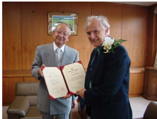
Presentation of Hon. DSc at Chiba