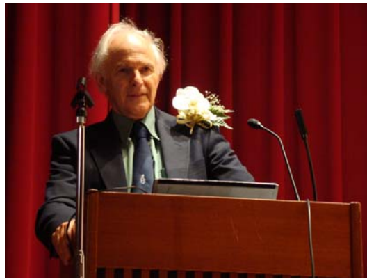
Speaking at Chiba University

July 10 th – Invited talk and honorary degree at Chiba University