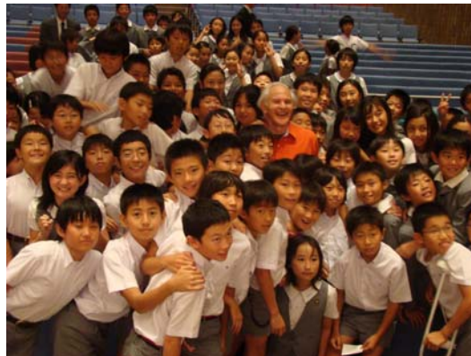
With children after talk at Keio Elementary School